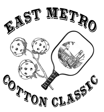
MONROE GA PICKLEBALL CLUB

On February 22 & 24, the Monroe Pickleball Club hosted our first tournament -- "East Metro Cotton Classic." It was great fun, and by all accounts a great success. Over $1,300 was raised for the Walton County Boys & Girls Club who are our gracious hosts 3-4 times a week for our club's pickleball play. Thank you to the many volunteers and over 50 players who came out to play. We hope to host our second tournament in the fall!